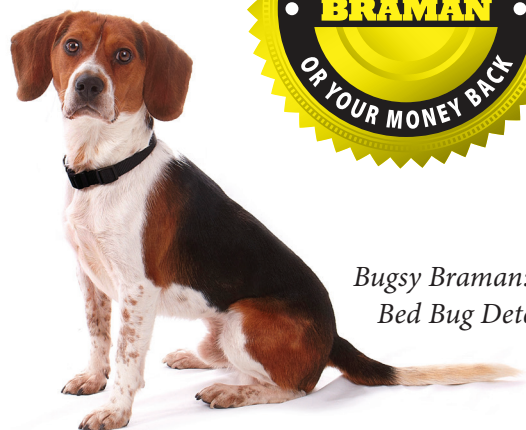
Buggy Braman: Bed Bug Detector