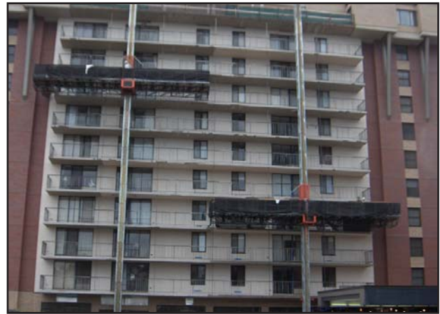
50-60 Longwood Avenue Balconies