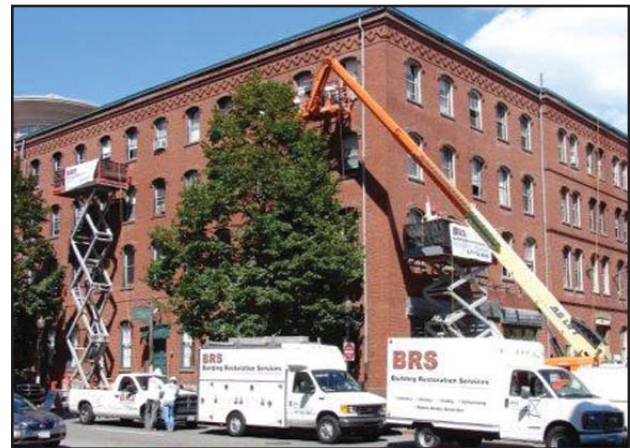
Boston Center for the Arts Restoration